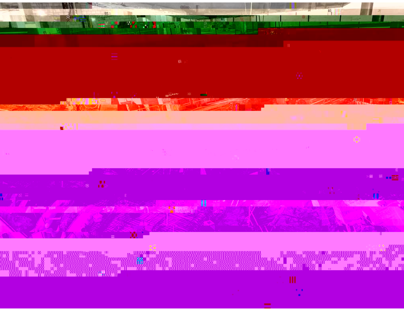
Additional views of waterproofing and foundation work in the Large Venue.